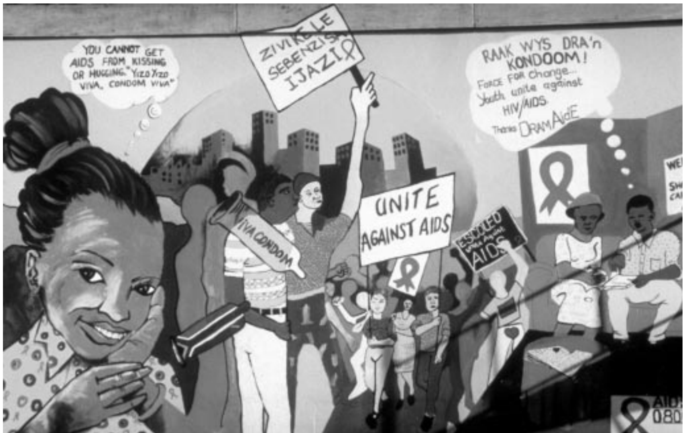
An AIDS mural painted by adolescents at Esikhawini Tecknikon, South Africa. Project of the Department of Health's Beyond Awareness Campaign.

In April 2000, ADEA contacted all African ministers of education, inviting them to identify and analyze promising interventions developed by their education systems in response to the problems and issues caused by HIV/AIDS.