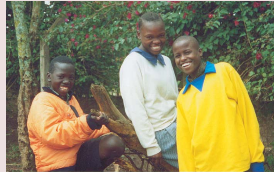
The Undugu Society helps boys like these to go back to their families and communities and to learn basic skills.

Street work: regular visits to the streets, usually at night when children have retired from their busy daytime chores and the streets are less crowded by members of the public. This aims at weaning the children off the streets for rehabilitation.