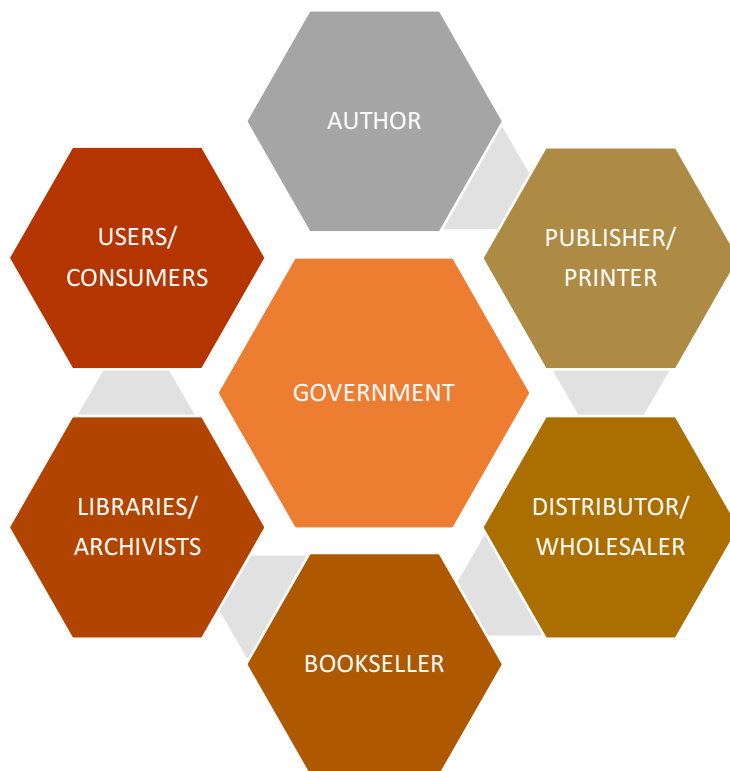
Figure 1: The Traditional Book Chain

National Book Policies (NBPs) as a concept has been with us since the 1970's. It was propagated by UNESCO ostensibly to urge member countries to formulate and adopt book and reading policies with a view to ensuring that books and other reading materials are developed and made commonplace for the purpose of supporting education, literacy and lifelong learning. NBPs require legal action through the Ministries of Education or Culture, because a law needs to be enacted for setting up a National Book Development Council (NBDC). This body is necessary for regulating the book industry, which is by nature complex. With the government being at the centre, it involves authors, publishers/printers, distributors/wholesalers, booksellers, libraries/archivists and last but not least the user/consumer (see Figure 1 below). Today the book chain is even more complex as all actors involved in publishing digital materials would need to be added. The globalization of electronic publishing did not lead to a balanced representation of publications and knowledge, but the dominance of research and information from the Global North remains. For example, the whole continent of Africa contains only about 2.6% of the world's geotagged Wikipedia articles despite having 14% of the world's population and 20% of the world's landmass (Information Geographics, 2016).