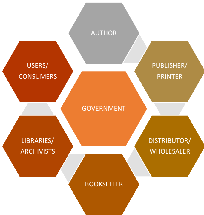
Figure 3: The traditional book chain stakeholders with their distinct roles

THE GOVERNMENT - This is the regulator and responsible for maintaining harmony within the industry through policy. They make laws, provide tax incentives and are responsible for training and supporting reading promotion through school and institutional libraries through budgeting and provision of funds. They support cross border trade and cultural autonomy.