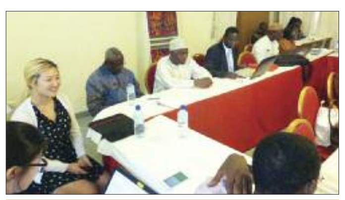
The participation of EWB representatives from Korea and other international institutions stepped up debates at the WGNFE Advisory Committee Session for December 2014

Regarding WGNFE 2015 Budget Program, the advisory committee listened to the proposals made by the WGNFE Coordination after