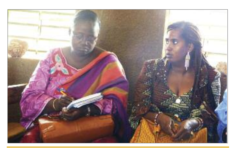
WGNFE has been actively involved in educational activities within countries. Here, two representatives of WGNFE personnel are visiting remote schools in Manga and Toécé, rural areas located about a hundred kilometers away from Ouagadougou, Burkina Faso.