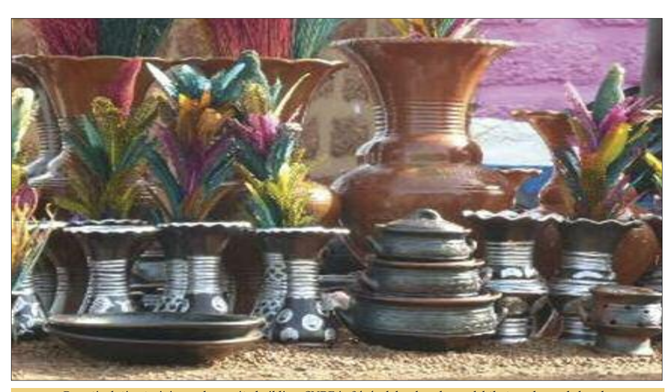
« By articulating training and capacity building, CNRE in Sénégal developed a model that can be used elsewhere on the Continent » Coll :I. B-L)

At assessment, it appeared that the viability of the project is clearly established. However, particular emphasis should be laid on encouraging communities to mobilize the youth so that they will benefit from the support of local communities to gain market shares.