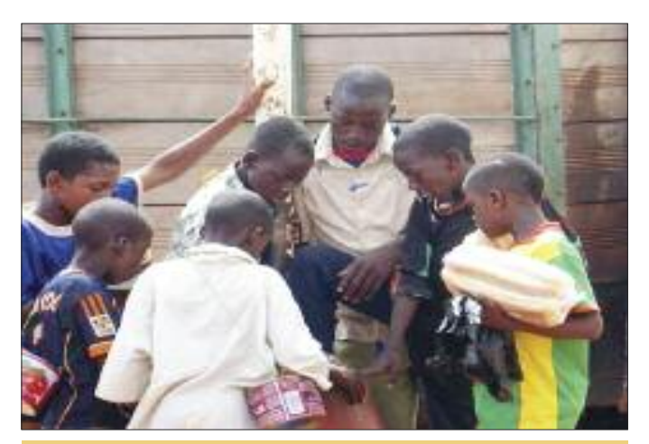
Street Children, the left out of today's education who will face unemployment challenges tomorrow