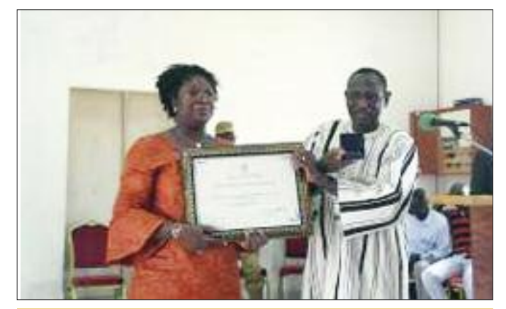
UNESCO Prize Certificate award to the APENF representative by the Vice Minister in charge of Literacy

Learners used the ceremony to express satisfaction for the lessons learned. Stakeholders in non-formal also used the event to reiterate their commitment towards intensifying their efforts to eradicate illiteracy in Burkina Faso and