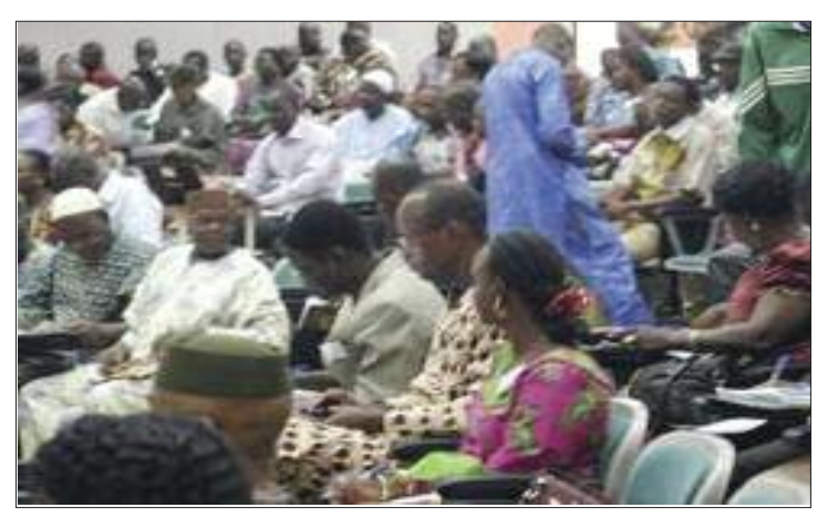
View of the conference room during the APENF General Assembly

In conclusion, the Assembly approved reports and took major decisions that included the organization's change in status. Strong recommendations were made, particularly as concerns: institutionalizing a day for each of the coordination, promoting the use of ICT at regional coordination levels with the aim of improving communication, restoring the study on advocacy with MENA authorities, local authorities, stakeholders on the ground and PTF. In addition, the decision was taken to officially launch the advocacy platform in Ouagadougou with the involvement of ministers as supervisors. The Assembly also instructed the Executive Secretariat to seek the contribution of WGNFE in solving the problem on significant differences between the statistical data related to innovations of stakeholders and those of the coordination.