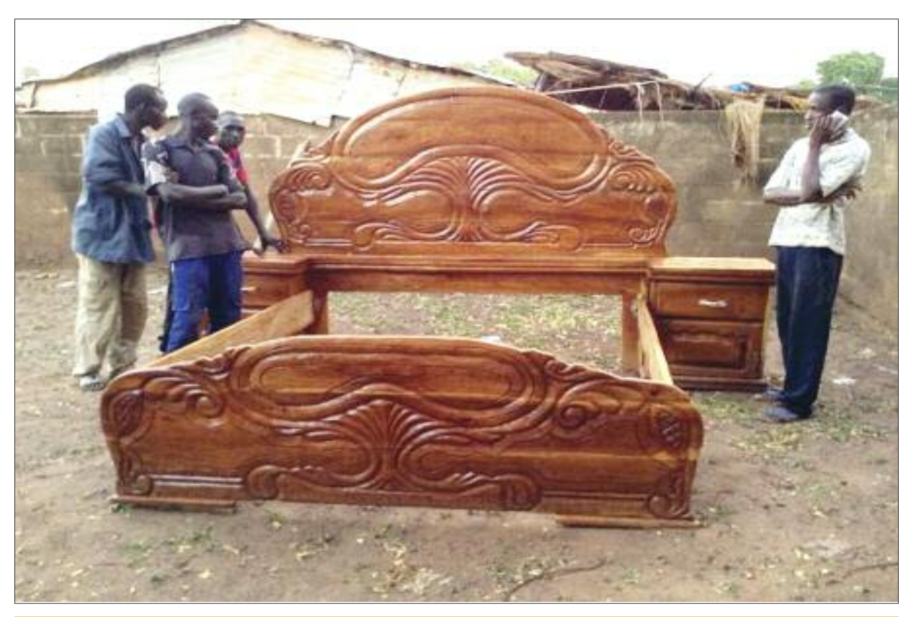
Koungheul Carpenters (Senegal)