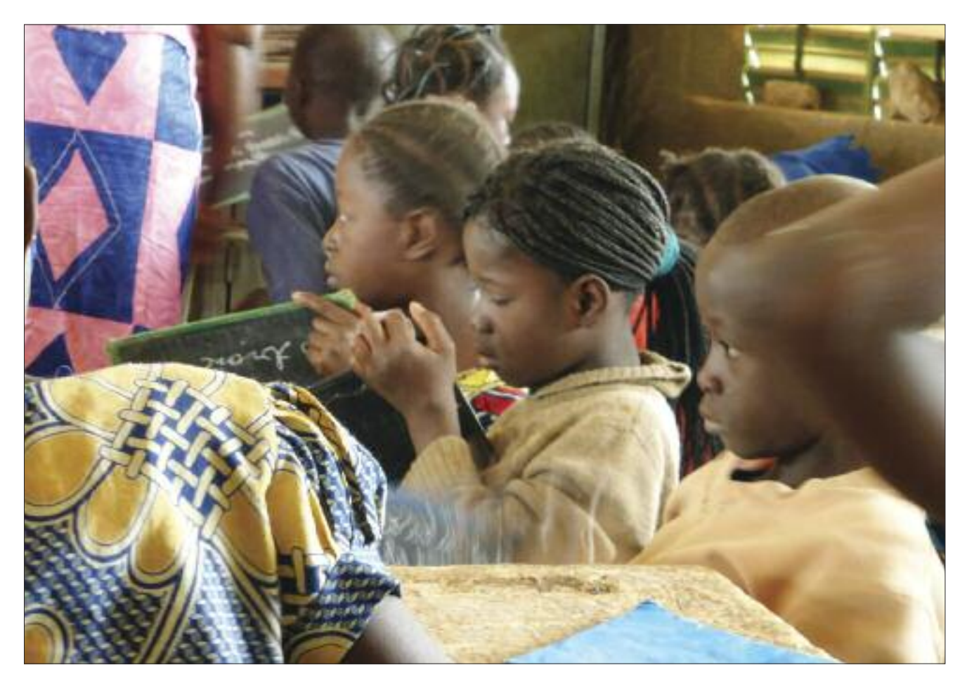
Children trying hard to study in overloaded classes, an evidence that Africa's future is taken seriously, in spite of enduring challenges

communication technologies to empower people of all ages living in rural and less developed urban areas. It provides interactive literacy courses to youths and adults in English and three African languages. The program, started in 2007, has benefited 6,000 youths and adults in Basic Education and Training centers for adults and 30 000 out-of-school children. It also focuses on sustainable development by providing learning content that cuts across health, the environment, social development and vocational training. This program is the result of a fruitful North-South partnership between the International Literacy Institute at the University of Pennsylvania (USA) and a national South African organization working in several countries in the region.