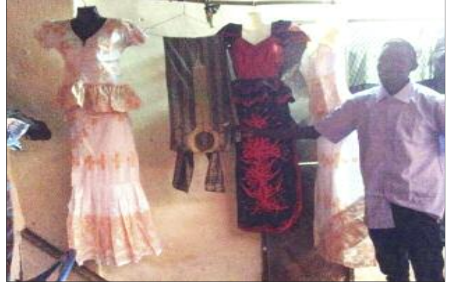
Koungheul Tailors (Senegal)