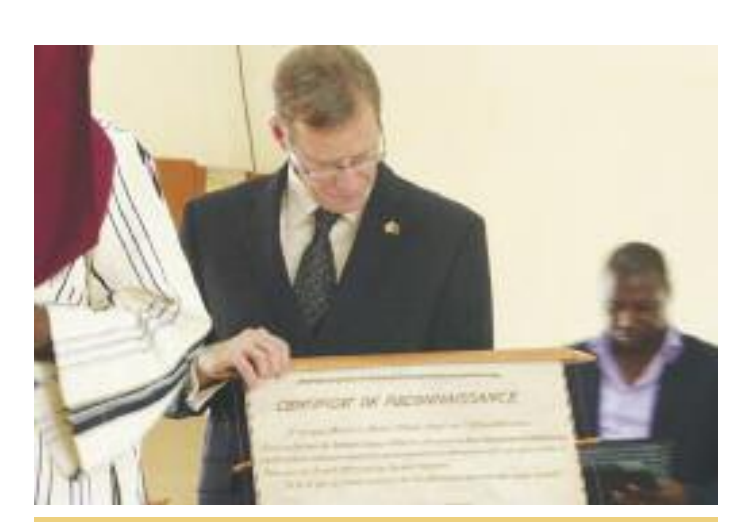
His Excellency the Canadian Ambassador to Burkina Faso receiving an award from representatives of Burkina Faso people for his indefatigable support to Literacy in Africa

Literacy must be strengthened and taken seriously by policy makers to make it a priority in educational policies.