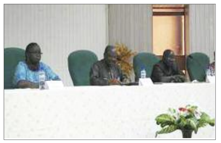
Opening of the GA by Mr. General Secretary of MENA

More than 400 people honoured this invitation including members of the 13 Coordinations corresponding to the 13 regions of Burkina Faso, technical and financial partners, sister associations and continental institutions like the WGNFE. The Secretary General of MENA chaired the ceremony, as representative of the Honourable Minister of Education and Literacy.