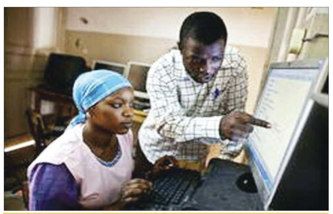
Information technologies have become an indispensable tool in African Universities

Why is technology so important for women's commitment? The answer given by learners of PAJEF courses is as follows: "Technology gives them a sense of freedom."