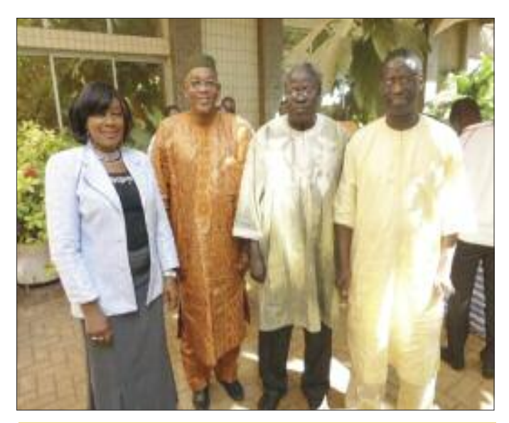
Coffee break with IAO WGNFE, the APENF representatives, accompanied by one of the consultants

ADEA also used the opportunity to organize the December session of the WGNFE Advisory Committee.