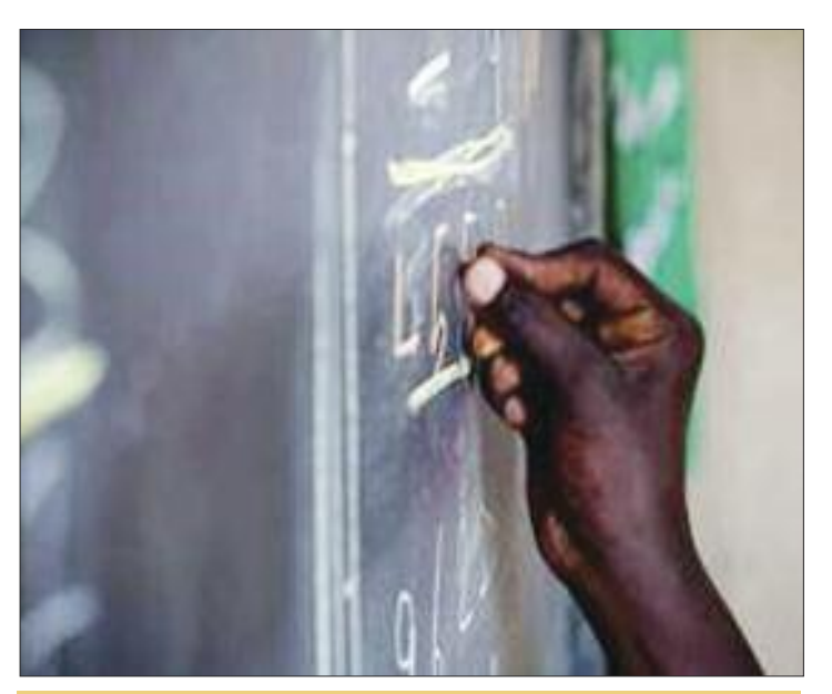
DR - DRT the Molteno Institute for Language and Literacy (South Africa) and the International Literacy Institute for the "Bridges to the Future Initiative", two innovative programs that use information and communication technologies to empower people of all ages in rural and less developed urban areas

Each prizewinner will receive US $ 20 000, a medal and a diploma during a ceremony in Dhaka (Bangladesh) on the occasion of International Literacy Day on 8 September. Each year UNESCO awards five literacy prizes: three UNESCO Confucius Prizes for Literacy, a prize established in 2005 thanks to the support of the Government of the People's Republic of China and two UNESCO King Sejong Prizes for Literacy, a price established in 1989 thanks to the support of the Government of the Republic of