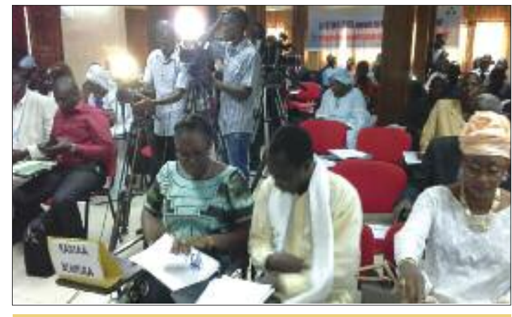
Burkina RAMAA Representatives

The presentation of the synthesis report results of studies and discussions were utilized to make recommendations to improve the production of the final report in December 2014.