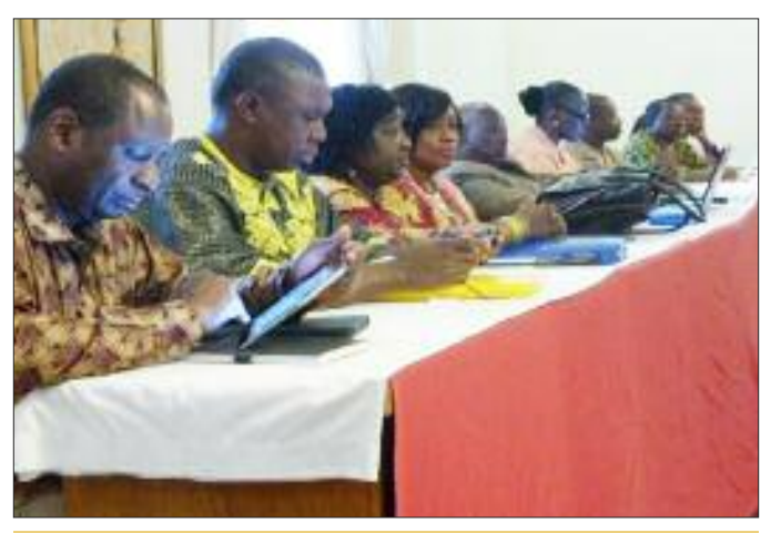
View of the meeting room. From left, the former CEO of UIL and MENA representatives from IAO Praia, Niger, ERNWACA and Benin

Participants also had to listen to reports on (1) the creation and maintenance of the African network for vulnerable youth and (2) the reconstruction of the WGNFE website.