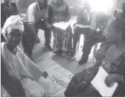
Trained facilitator from a local community leading a literacy group.

stands at 17% compared to 75% in the countryside, e. g. Amhara); the ethnic variable (in Namibia, where only 5% of the Afrikaans are illiterate versus 80% of the Sans population); the sedentary-nomadic difference (in Nigeria, 99% of nomads are illiterate); and the disability factor (in sub-Saharan Africa, over 90% of disabled children have no means of learning to read and write).